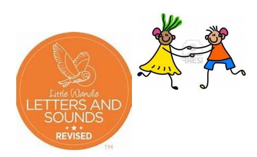
Little Wandle Phonics

We will be reviewing the following digraphs / trigraphs: ai / ee / igh / oa / oo / oo / ar / or / ur / ow / oi / ear / air / er