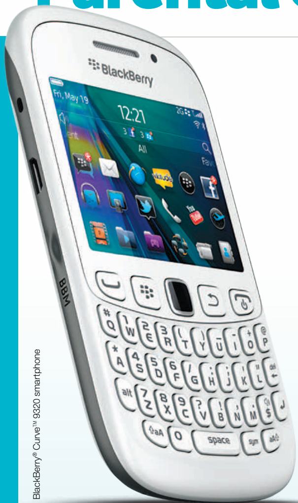
BlackBerry® Curve™ 9320 smartphone

Parental Controls are designed to help you have more control over how the features of the BlackBerry® smartphone are used.